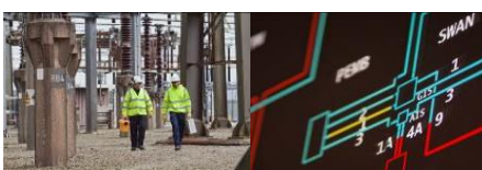
Electricity Transmission Owns, builds and maintains the England and Wales high voltage network