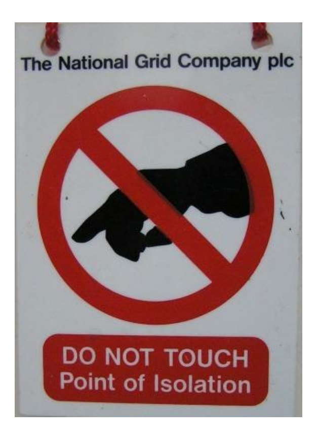
Figure E1 - Caution Notice