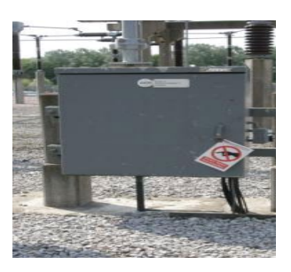
Figure 4.4A – Example of a Key Safe and safety precautions applied

An Apricot coloured T card shall be filled in with the appropriate details and placed in the POI / Earthing / RISSP section of the Substation Status Board. There is no requirement to record HV safety precautions which are remote to the Location as these are the responsibility of the Control Person (Safety) .