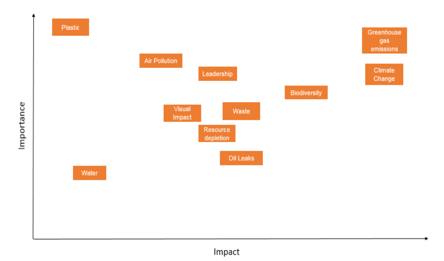
Figure 4- Impact and importance matrix

A review of the impact of each area was considered and mapped against its importance for both National Grid and our stakeholders. The result of the impact/importance materiality map is shown below.