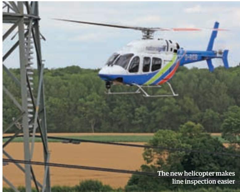
The new helicopter makes line inspection easier