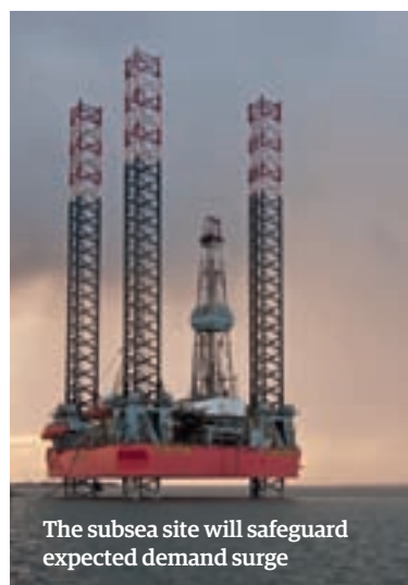
The subsea site will safeguard expected demand surge

... visit www.nationalgrid.com/corporate/Our+Responsibility/Our+Impacts/Envpol