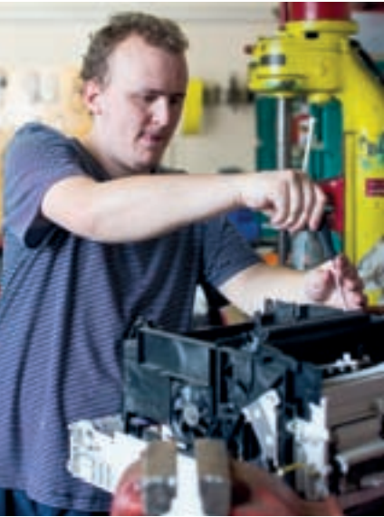
Recycling printers and photocopiers teaches the service users useful skills and helps the environment

disabilities, autism and mental health issues to physical disability and deaf-blind - that one even arrives at 7am to start work, two hours early.