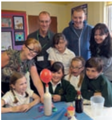
Pupils are impressed by an experiment demonstrating how gas is produced