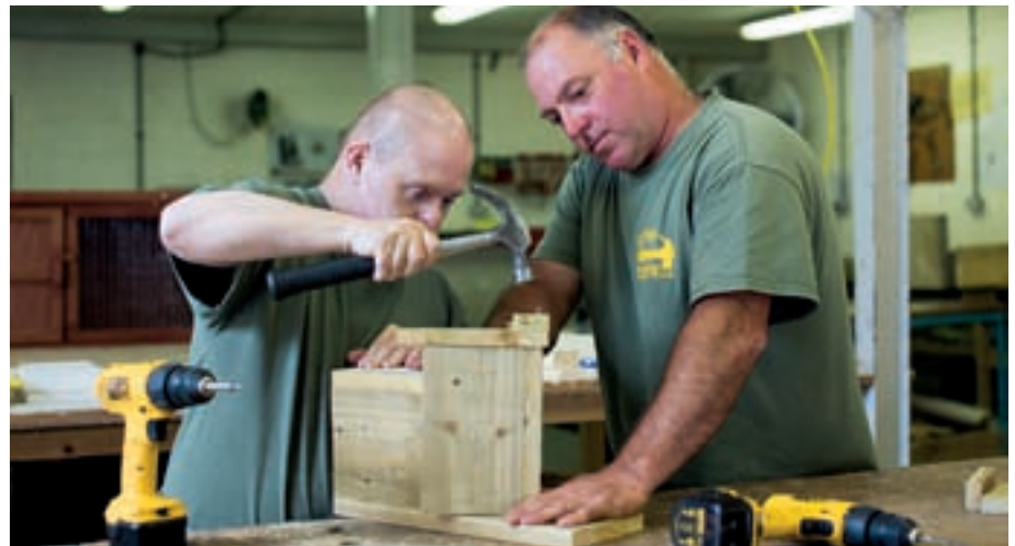
Most items built at the workshop are then sold by their makers at the SSP shop

"We wanted to use our skills to look after people with learning disabilities... to develop them and build their self-confidence"