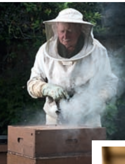
A little smoke masks an alarm pheromone distributed by guard bees and calms the hive

"We move some of the hives to the heather moors in late July. Heather honey is dark and aromatic and a lot of people like it, but I prefer the early season clover honey."