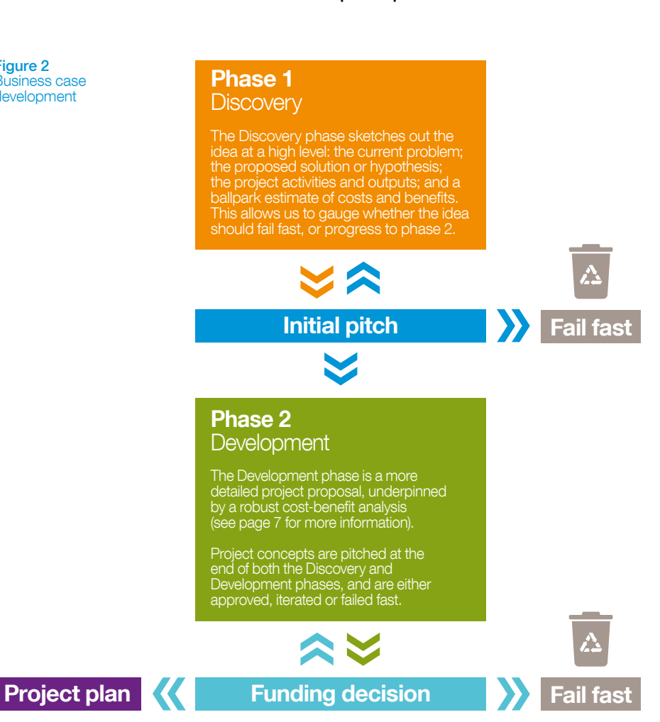
Figure 2 Business case development

The second stage of our innovation process develops the idea into a business case and follows a two-phase process: