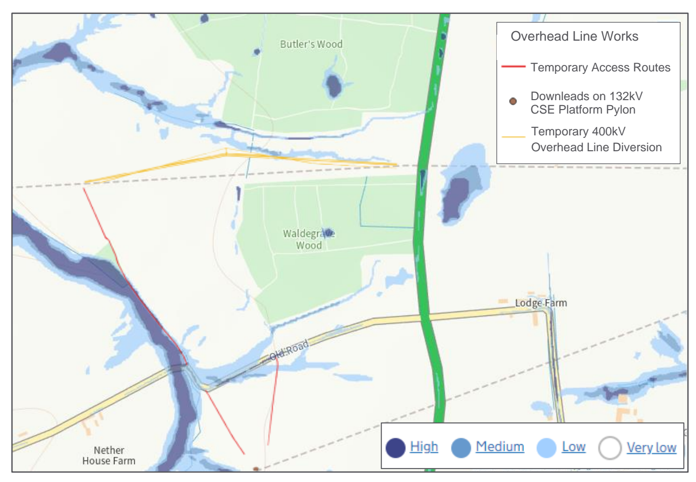
Figure A7.4: Risk of Flooding from Surface Water Map (site boundary outlined in red)