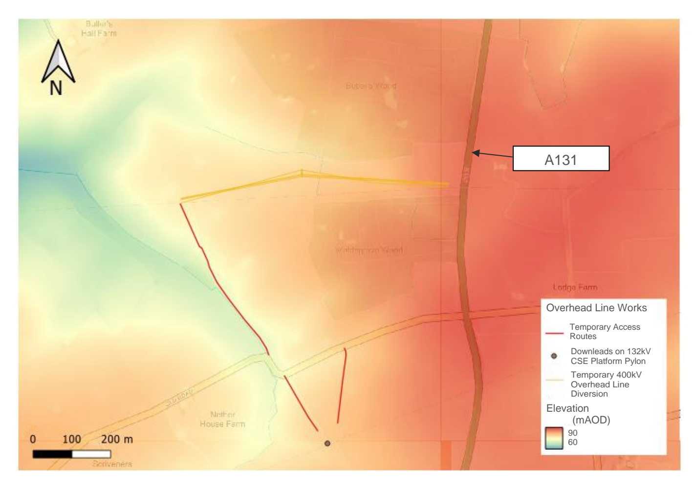
Figure A7.3: Topography (filtered LiDAR shown) Contains Environment Agency information © Environment Agency and/or database right Contains Ordnance Survey data © Crown copyright and database right 2022