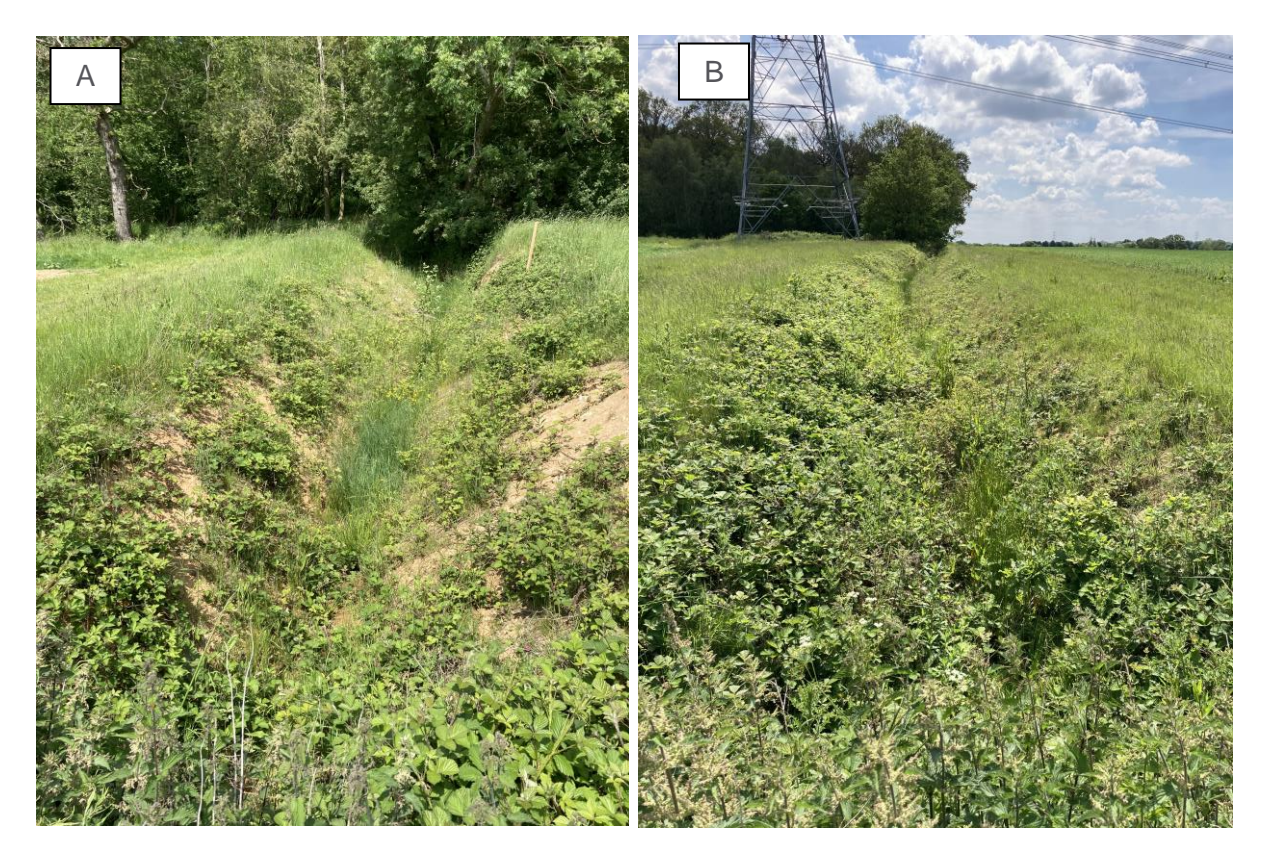
Image A7.1: Photographs Drainage ditch crossing the site A) looking north towards Butler's Wood. B) looking south towards Waldegrave Woods