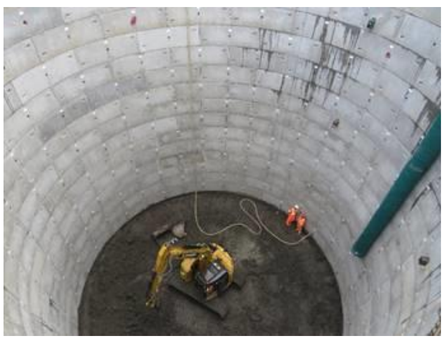
Progress on the shaft rings.