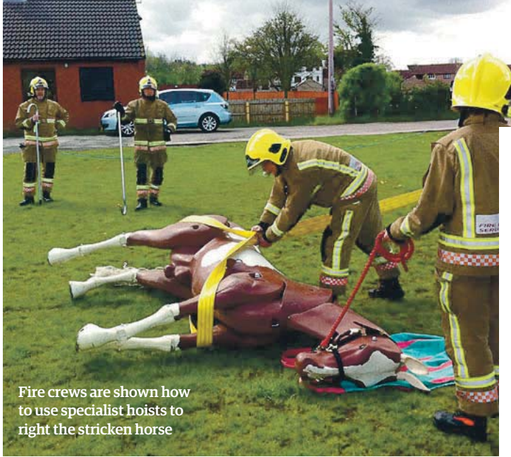
It's up and away careful rescue

The crews keep the head still as they begin the rescue