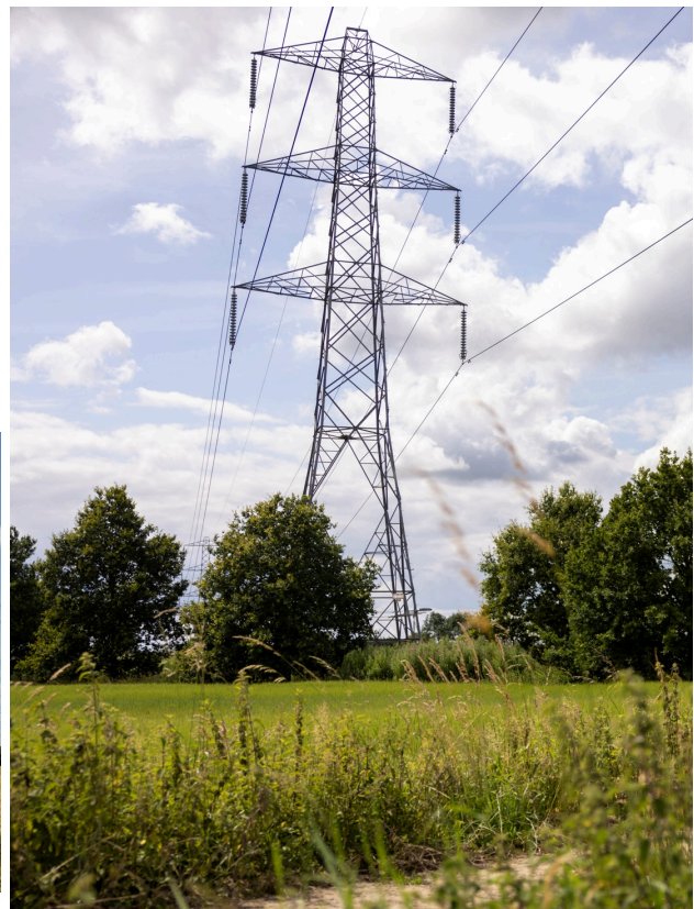
The photograph above shows an example of a fully constructed pylon.