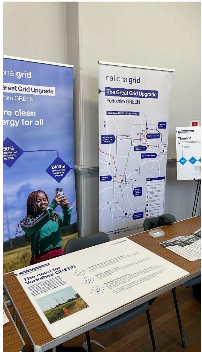
The photograph above shows the Yorkshire GREEN stand at the EcoEnergy Fair 2025.

We really valued the opportunity to speak with local residents about the Yorkshire GREEN project and how it can support the region's transition to clean energy".