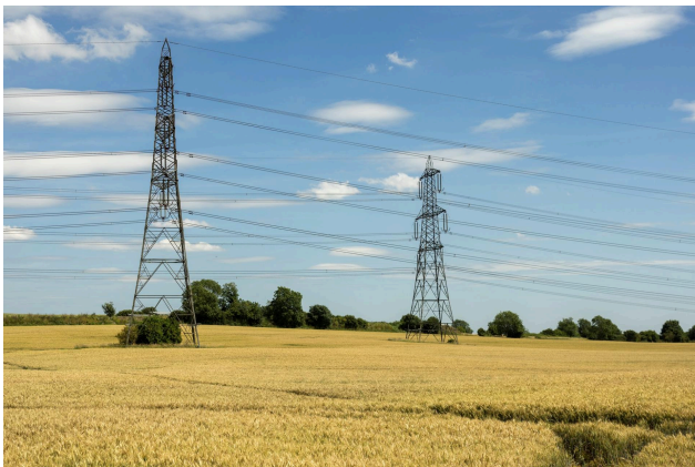
The photograph above shows examples of fully constructed pylons.

Click here to find out 12 more facts you might not know about pylons.