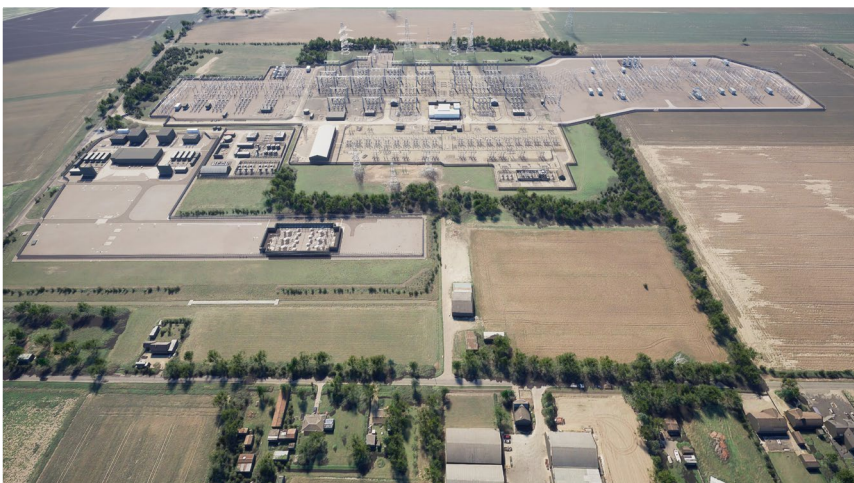
Left and above: Indicative mock ups of the completed works.