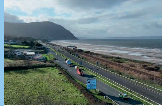
Travelling past Penmaenmawr