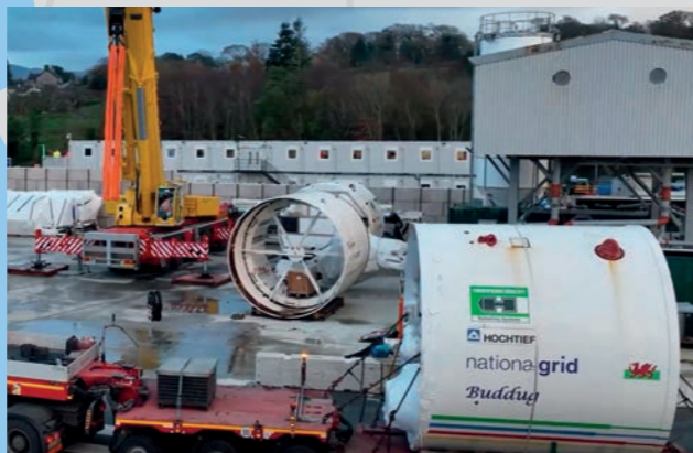
Arriving at the Eryri VIP project site in Minffordd