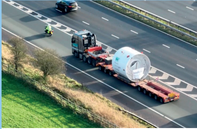
Buddug travelling along the A55