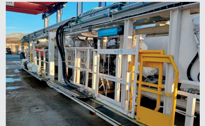
Gantries arriving on site