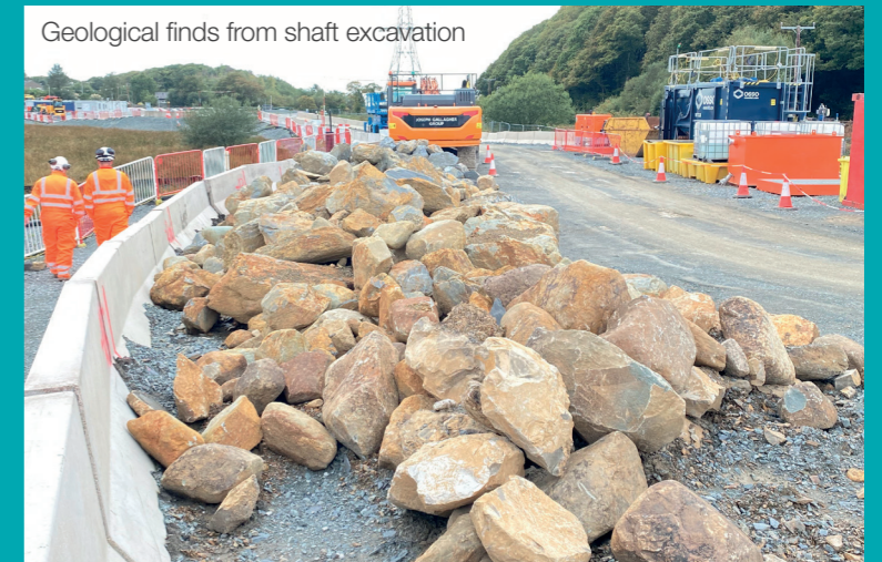
Geological finds from shaft excavation

Following this, the project team will start working on the construction of the tunnel headhouse and sealing end compound which will connect the underground cables to the existing overhead line.