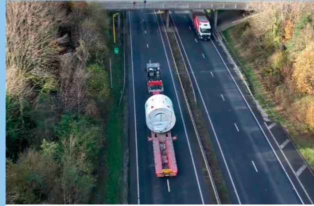
On the A55 in Denbighshire