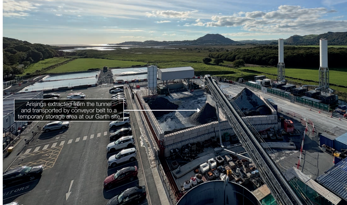
Arisings extracted from the tunnel and transported by conveyor belt to a temporary storage area at our Garth site