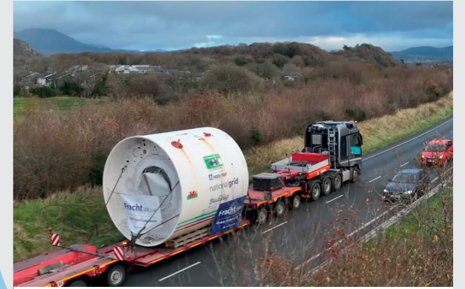
Travelling along the A487