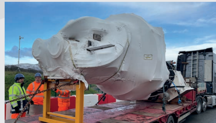
Cutter head and erector with carrier beam arriving on site