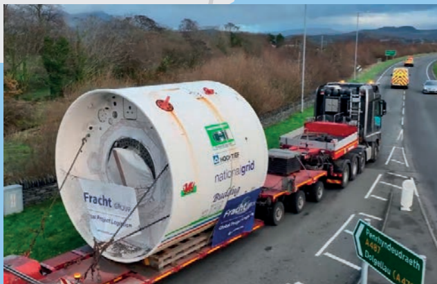
At the Porthmadog roundabout