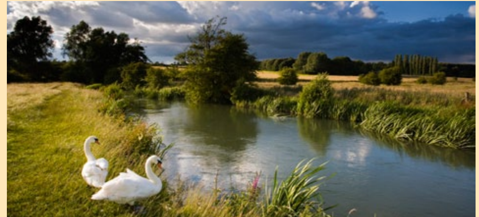
The River Windrush, which flows south-eastwards with the other principle rivers of the area to form the headwaters of the Thames.