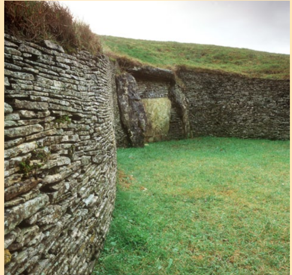
Belas Knapp, a particularly fine example of a Neolithic long barrow.