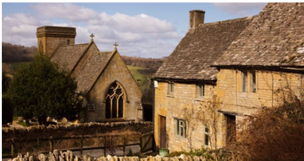
An example of the locally distinctive quarried stone used for domestic architecture at Snowhill, Gloucestershire.