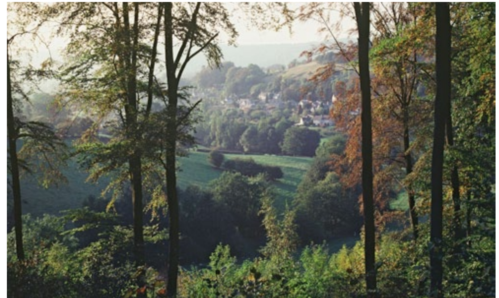
Workman's Wood, Cotswold Commons and Beechwoods NNR.