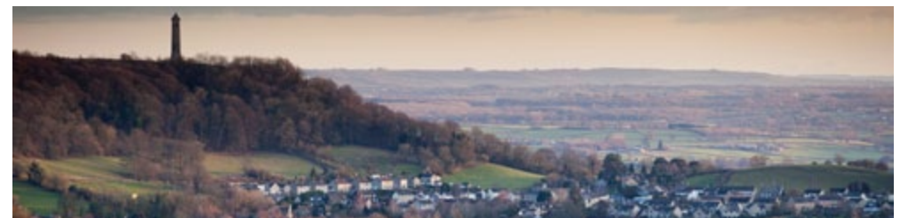
The Cotswold escarpment at Stinchombe, Gloucestershire.

The principal Cotswold towns and cities – Stroud, Cirencester and Bath – lie on the edge of the area. Bath is internationally known and designated as a WHS for its Roman and Georgian architecture. The scarp and dip slope landscape around Bath is less pronounced, breaking up into a series of hills and valleys often referred to as combes. The smaller market towns and villages tend to lie in the valley bottoms, occasionally along the valley sides and at the scarp foot on springlines. Stow-on-the-Wold is an exception as a hill top town. Settlement patterns vary from compact to dispersed and ribbon forms, with some lying round a central green. Away from these sheltered town and villages, which are usually never far from water, the higher ground is often sparsely populated, with only a few hamlets and isolated farmsteads. On the open, high wold and dip slope the oldest and most recent roads sweep across the landscape in almost straight lines; however, along the valleys the typical road is a winding lane linking villages. The combination of high-quality landscape, tranquillity and an excellent rights of way footpath network has made the Cotswolds a popular destination for quiet outdoor recreation.