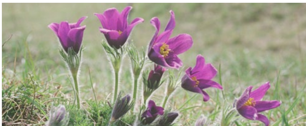
Pasque flower found as part of the limestone grassland flora.

The Government's new strategy for biodiversity in England, Biodiversity 2020, replaces the previous Biodiversity Action Plan (BAP) led approach. Priority habitats and species are identified in Biodiversity 2020, but references to BAP priority habitats and species, and previous national targets have been