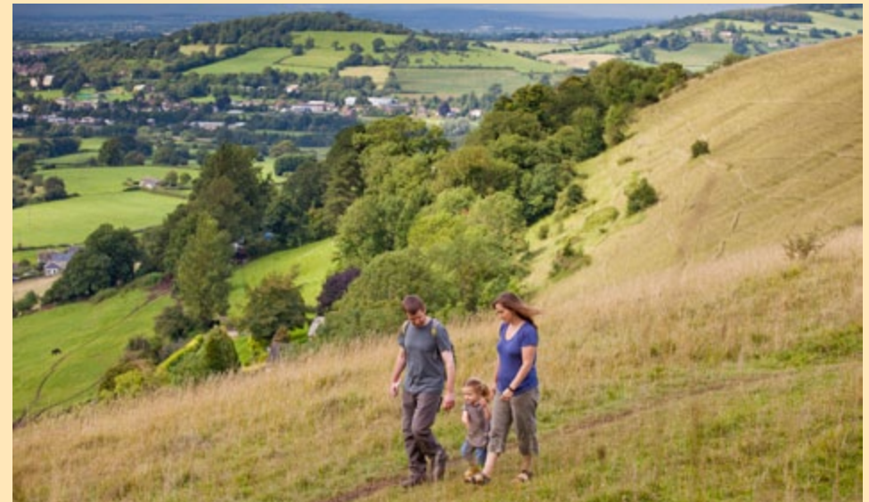
Walkers enjoying the network of footpaths.