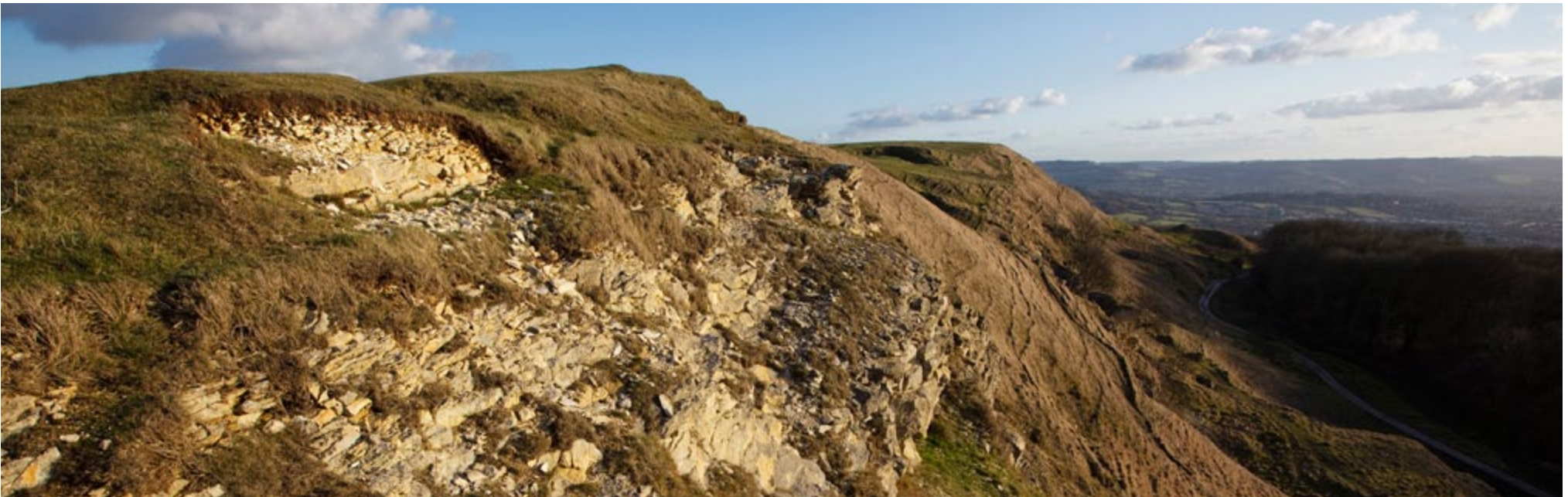
Cotswold escarpment at Cleeve Hill Common - the highest point on the scarp and showing the oolitic limestone geology.

Biodiversity and geodiversity are crucial in supporting the full range of ecosystem services provided by this landscape. Wildlife and geologically-rich landscapes are also of cultural value and are included in this section of the analysis. This analysis shows the projected impact of Statements of Environmental Opportunity on the value of nominated ecosystem services within this landscape.