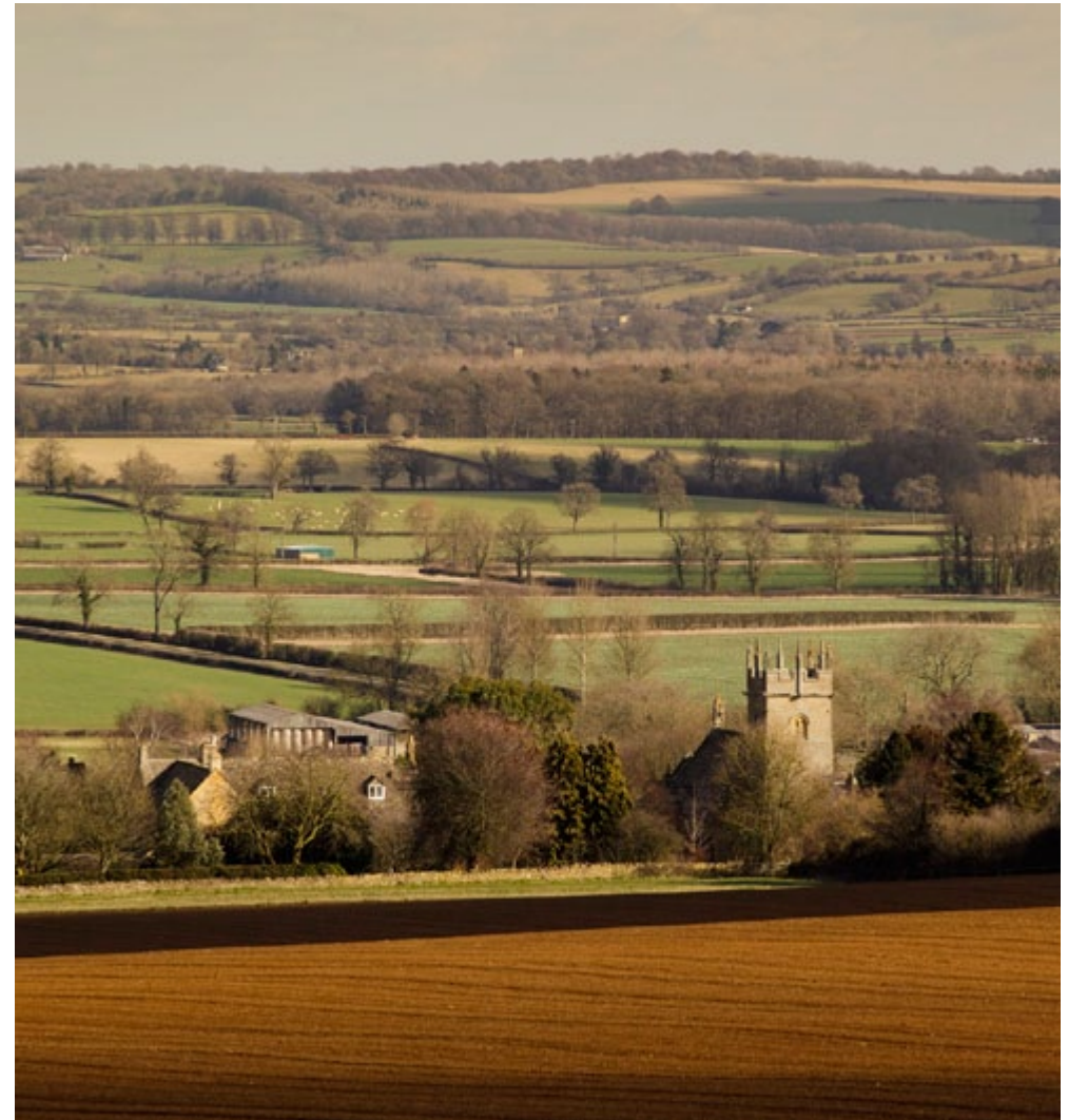
Cotswolds field pattern seen at Longborough.