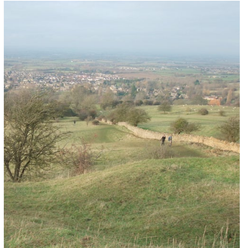
Walking the Cotswold Way from Broadway Tower with expansive views over the Severn and Avon Vales NCA.