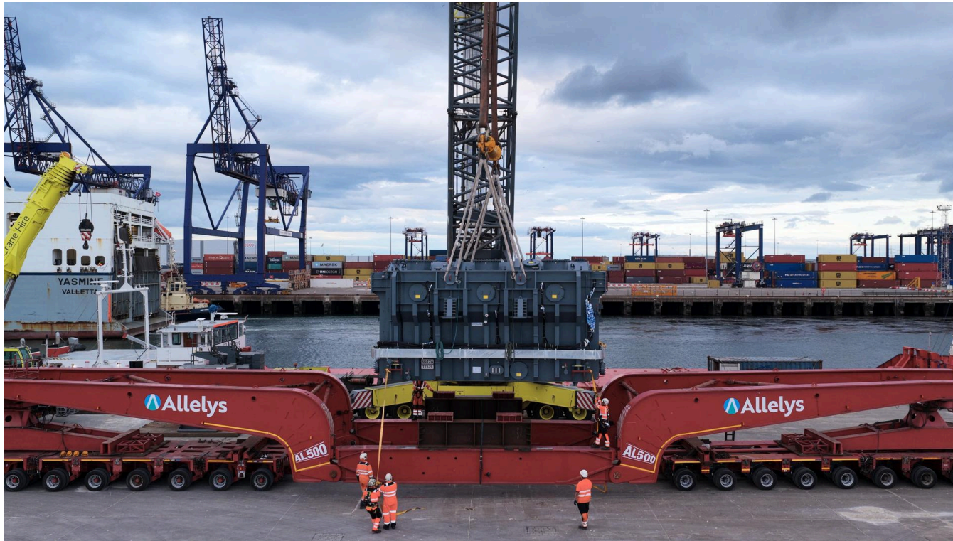
Image of the first Overton transformer arriving at Teesport Docks.

In some areas along the delivery route you may notice: