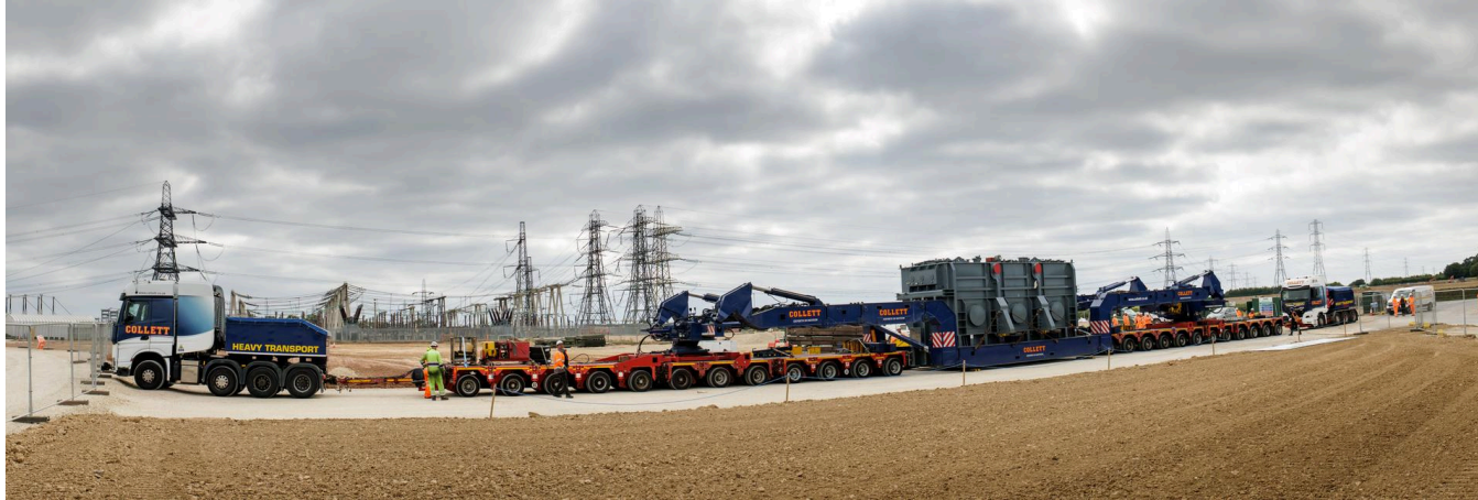
Image of the supergrid transformer arriving at our Monk Fryston Substation.

The transformers will play a crucial role in our substations by converting electricity to higher or lower voltages, ensuring it can be transmitted over long distances and safely distributed to homes and businesses.