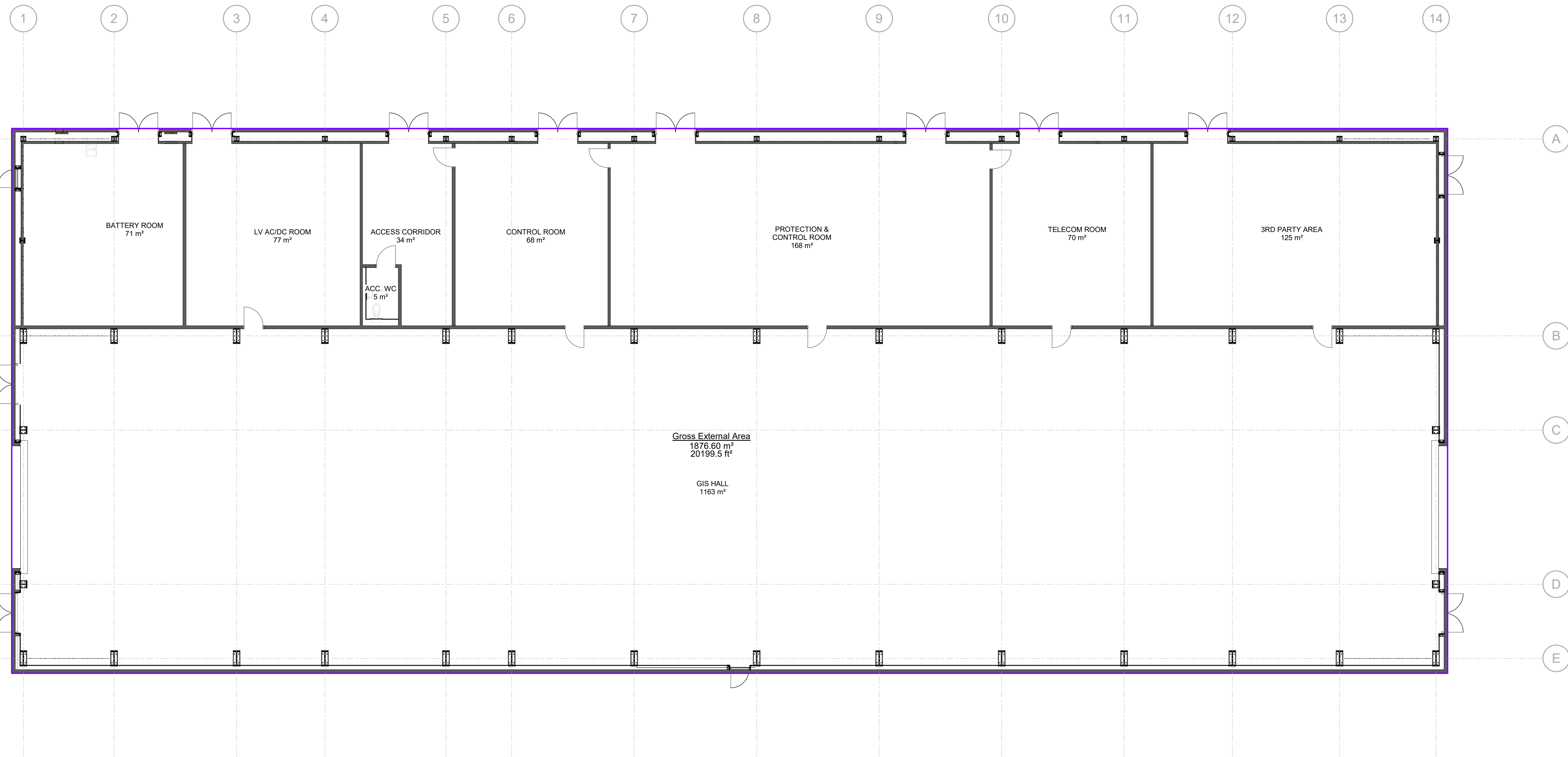
2 | Level 00_Gross External Area Plan Scale: 1 : 100