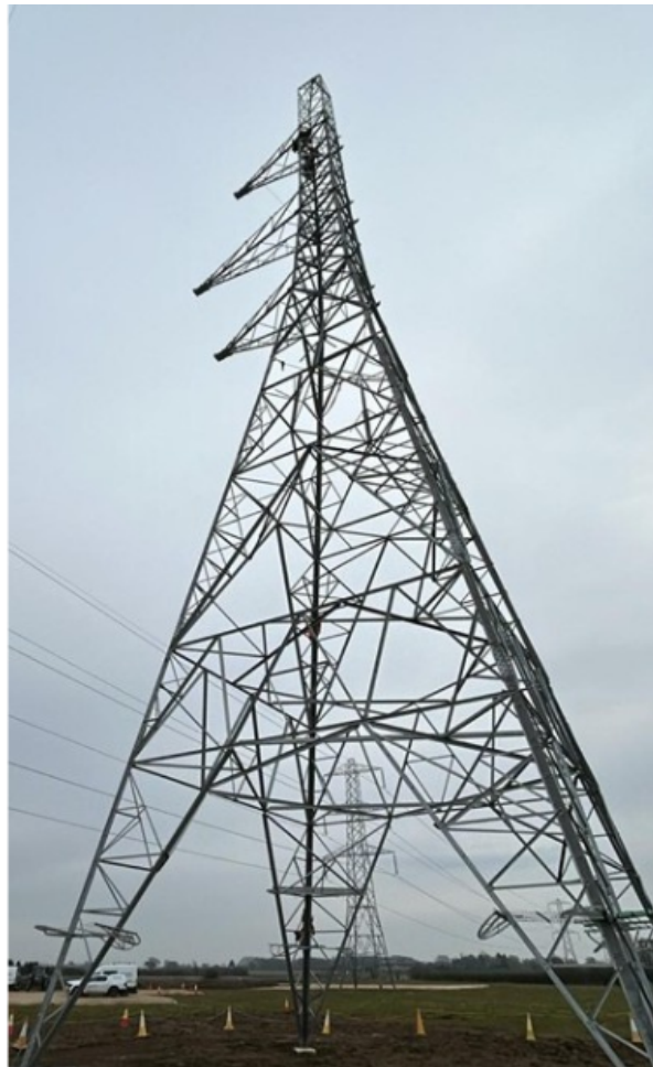
Photographs of an existing pylon in Tadcaster that will be upgraded as part of our works and a temporary pylon near Moor Monkton.

If you can't find what you are looking for on our website or have any general questions or enquiries about the Yorkshire GREEN project, please don't hesitate to contact our dedicated Community Relations Team: