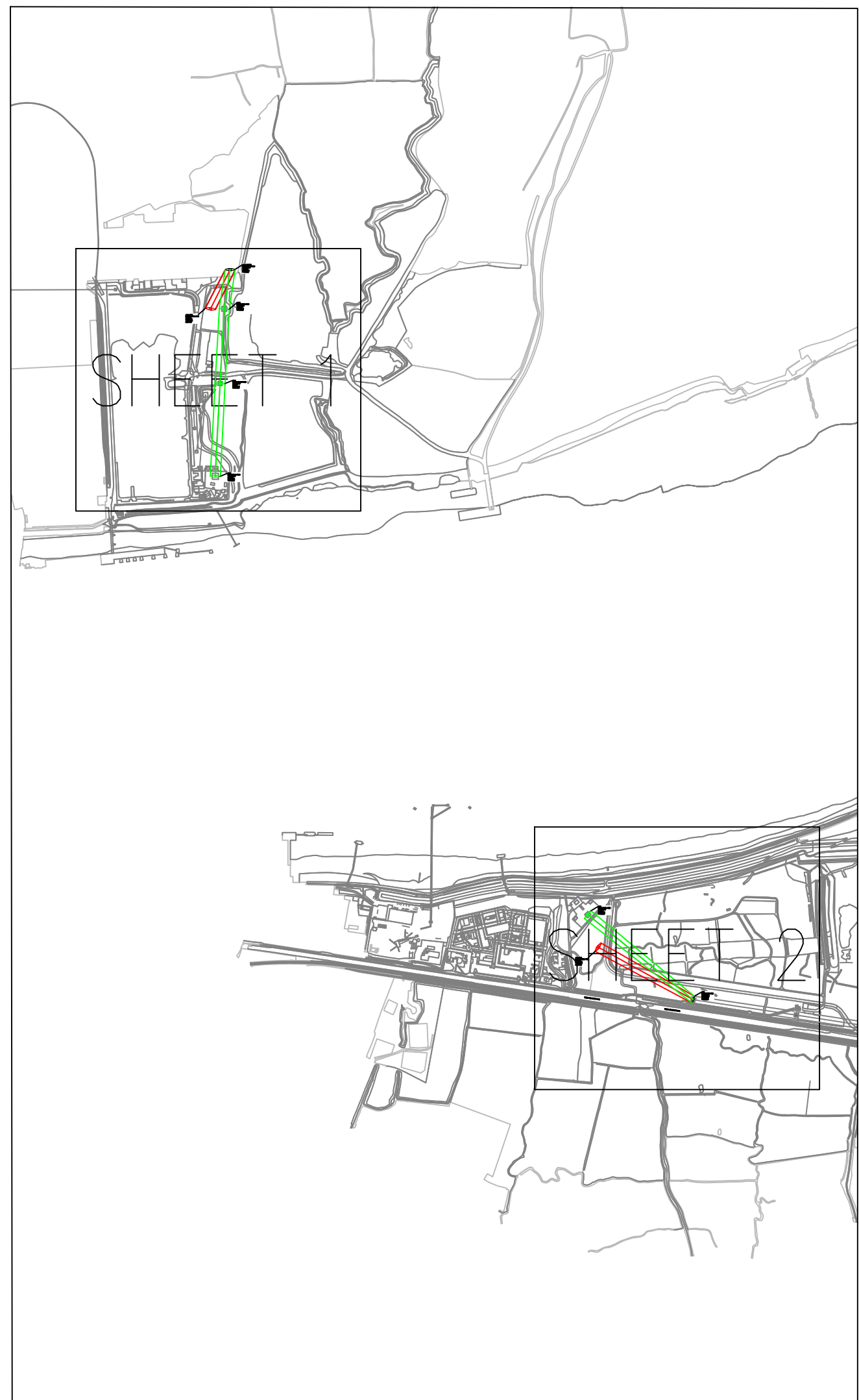
SHEET PLAN (NTS)