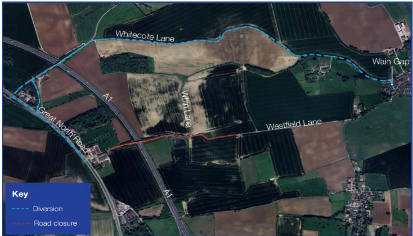
Image caption: Map showing the road closure on Westfield Lane and the diversion route.