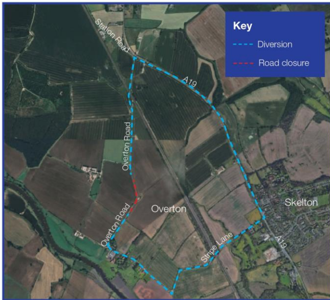
Image caption: Map showing the road closure on Overton Road and diversion route.