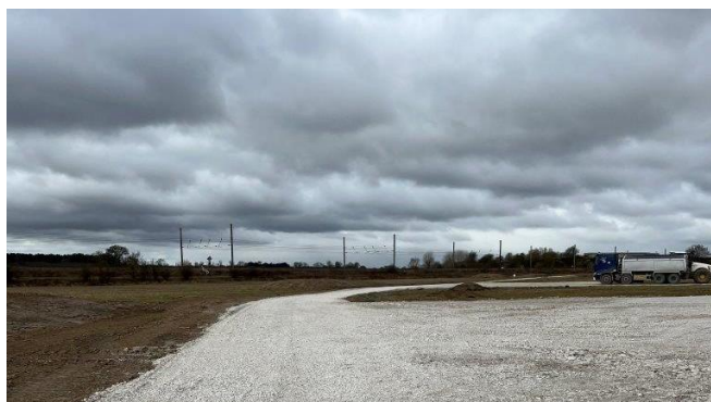
Image caption: A 'crane pad' near Overton Road, this will support cranes and heavy load vehicles, preventing damage to the ground.