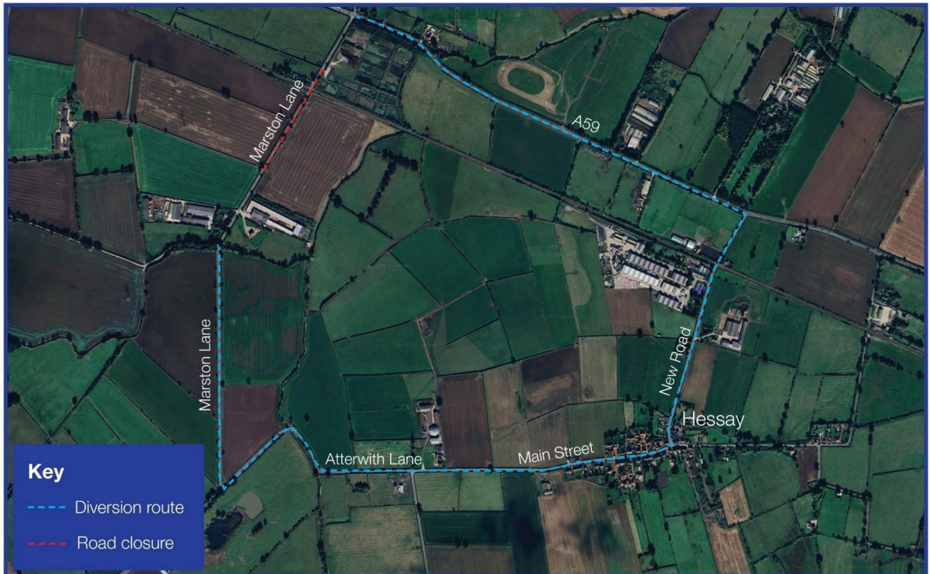
Image caption: Map showing the road closure on Marston Lane and the diversion route.