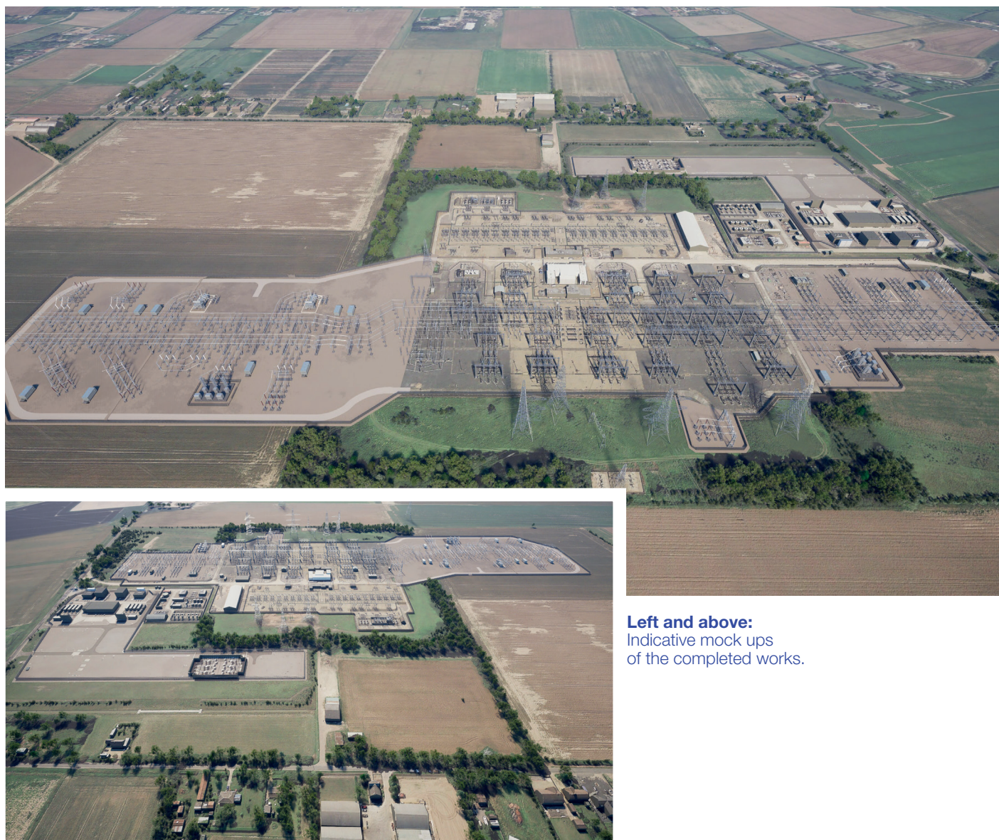
Left and above: Indicative mock ups of the completed works.

The Great Grid Upgrade will play a significant part in meeting the UK Government's plans to power all homes and businesses with green energy by 2030 ensuring our electricity network is fit for the future.