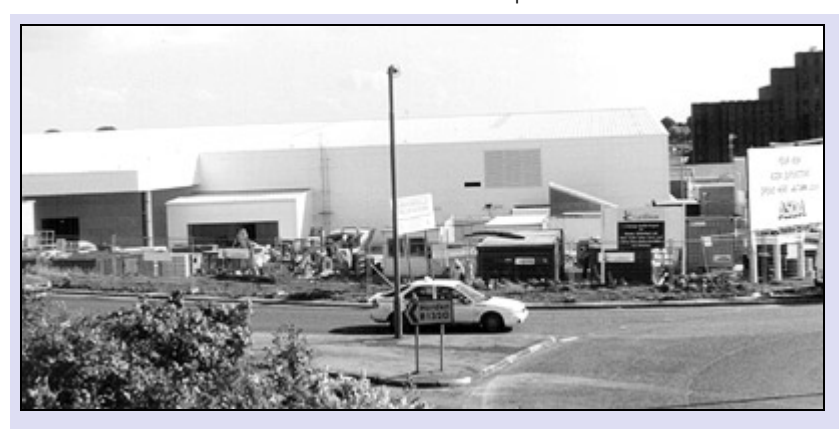
Asda, Peterlee - promoting the district's major centres