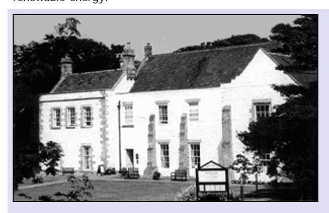
Seaton Holme, Easington Village - listed building

E4. Reducing transport movements and energy requirements by the conservation of energy and non-renewable resources including land, and the development of new sources of renewable energy.