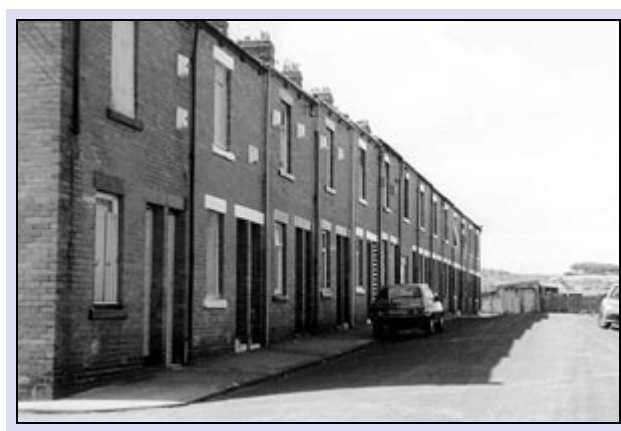
Former colliery village

5.32 The remaining villages of Castle Eden, Dalton-le-Dale, Haswell Plough, Hawthorn, High Hesleden, Hutton Henry, Little Thorpe and Seaton are small settlements containing very few shops, facilities and sources of employment. Any large scale housing development is, therefore, likely to generate significant additional car borne trips as residents travel to adjacent settlements to places of employment, shops, schools and other facilities. It is therefore intended that housing in these settlements should be limited to small scale developments provided it is appropriate in scale, character and form with the existing village.