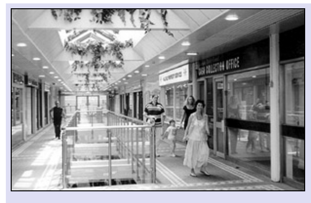
Providing jobs, shops and other facilities

1.40 The population of the District has been falling since the 1960's: from a resident population of around 110,000 in 1971 the number of people living in the District has fallen to about 98,000 in 1991. In the light of the regeneration initiatives being undertaken in the district the Structure Plan estimates that the population will stabilise at around 98,000 by the year 2006.