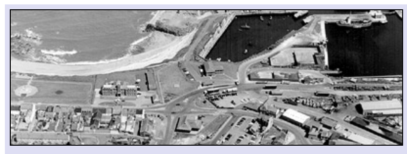
Regenerating Seaham - promoting tourism and leisure

1.39 The revised car parking standards will be based upon the advice given in PPG 3 and 13, and are expected to be adopted towards the end of 2001/early 2002. Once adopted, the revised parking standards will be incorporated into the Local Plan as supplementary planning guidance.