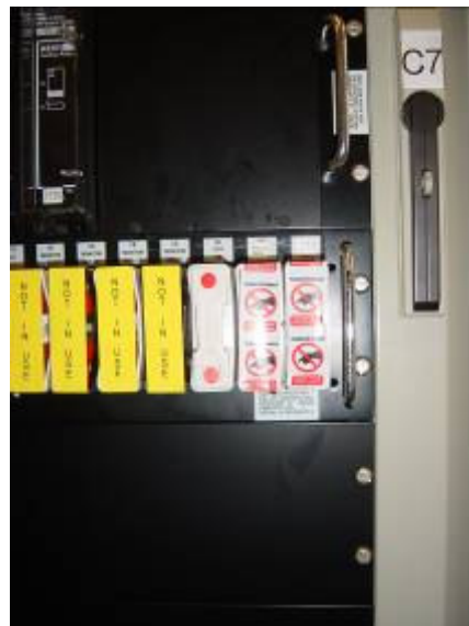
Figure 4.1 – Example of Protection Multiple “S” Link Isolation

Reference shall be made to protection drawings to determine Point(s) of Isolation .