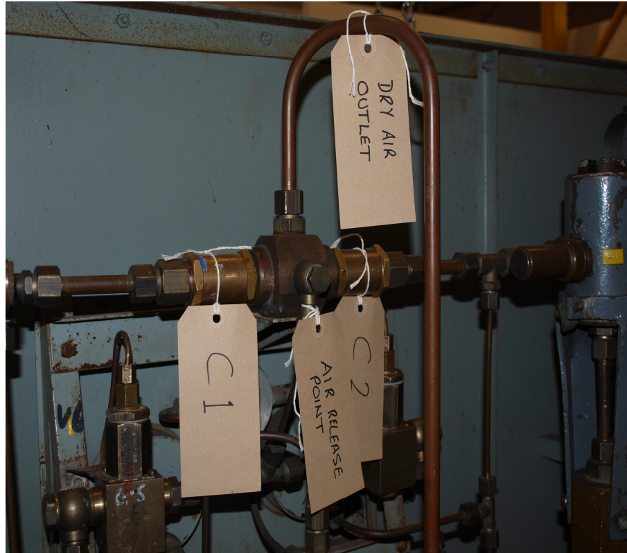
Figure 5.3A – Example of physically identifying the point(s) at which the Equipment is to be vented using temporary labels